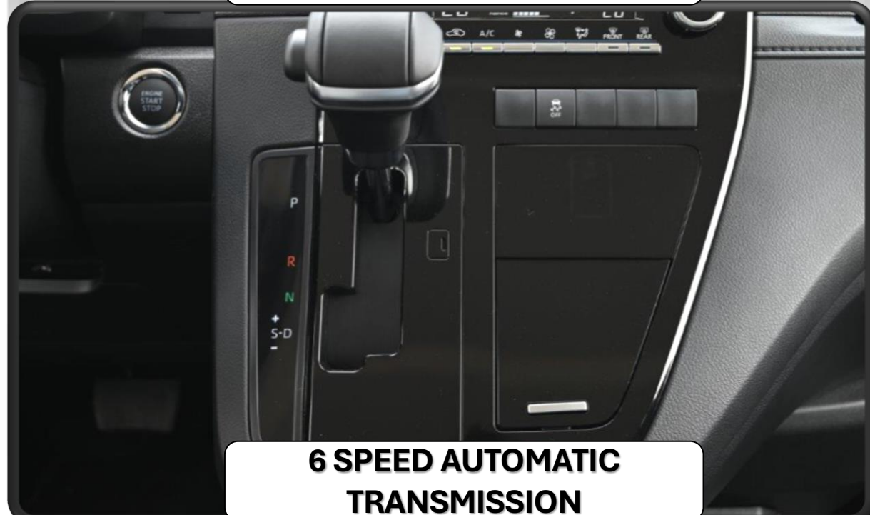
6 SPEED AUTOMATIC TRANSMISSION