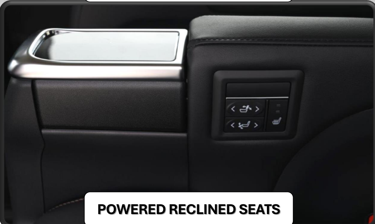
POWERED RECLINED SEATS