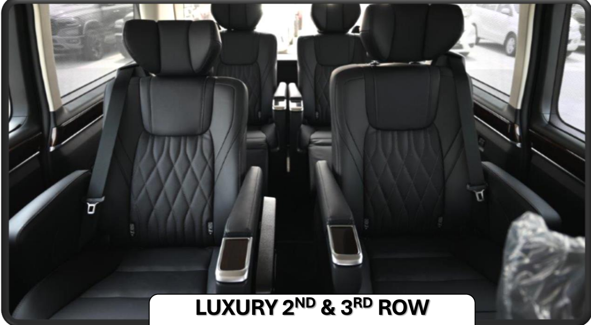
LUXURY 2 ND & 3 RD ROW CAPTAIN SEATS