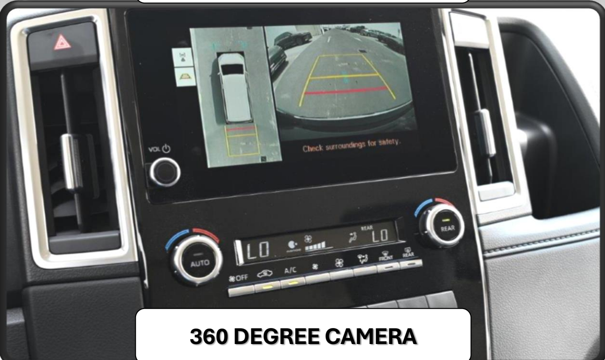
360 DEGREE CAMERA