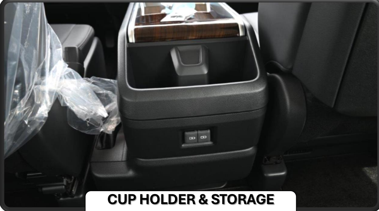
CUP HOLDER & STORAGE SPACE