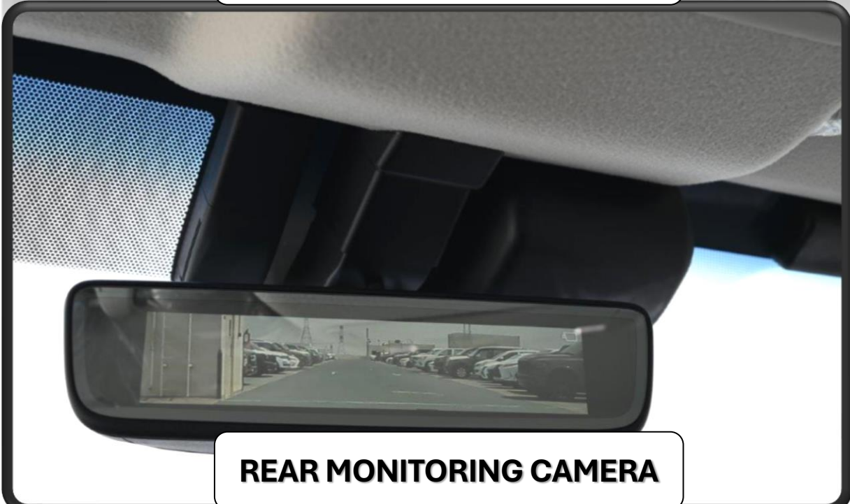
REAR MONITORING CAMERA