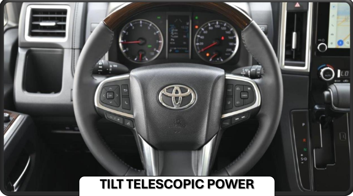
TILT TELESCOPIC POWER STEERING